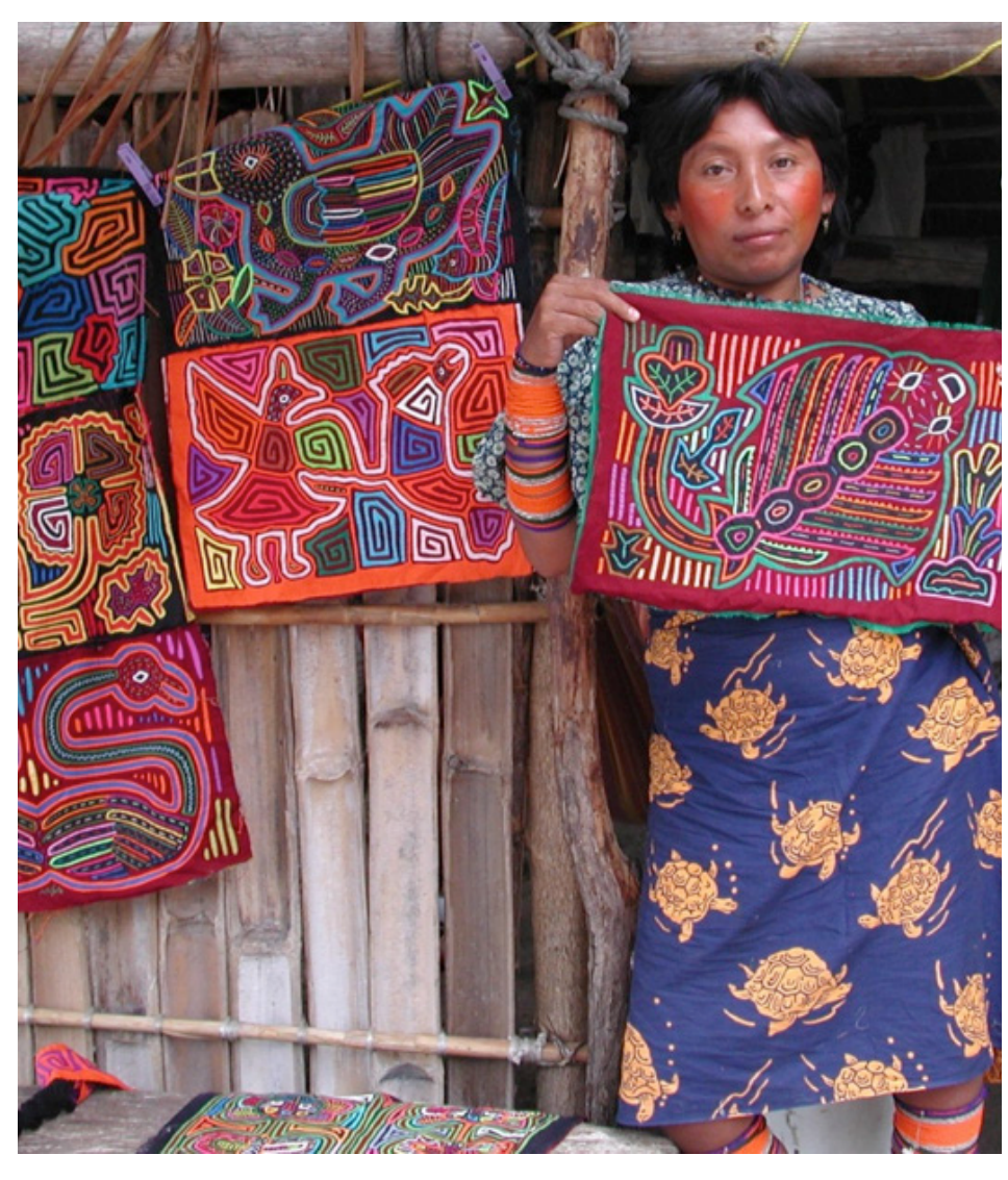
Cuna woman holding a mola in San Blas, Panama.